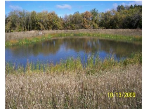
Brown County Farms Pond